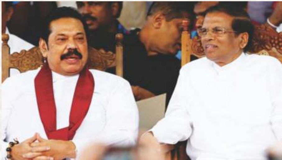
President Mahinda Rajapaksa as a Prime Minister by President Maithripala Sirisena

The President said the country's problems cannot be solved through