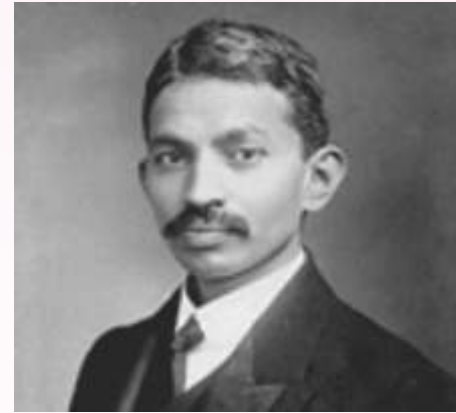
✍ M K Gandhi

Indentured labourers were called 'coolies' by the Europeans. A 'coolie' means a porter. The expression was used so extensively that the indentured labourers began to describe themselves as 'coolies'. Hundreds of Europeans called Indian lawyers and Indian traders 'coolie' lawyers and 'coolie' traders. There were some Europeans who were unable to perceive or believe that the name implied an insult, but many used it as a term of deliberate contempt. Free Indians, therefore, tried to differentiate themselves from the indentured labourers. For this and other reasons peculiar to conditions in