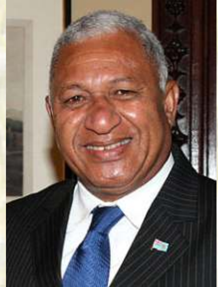
Mr. Frank Bainimarama

Fiji First's leader, Mr Bainimarama has once again been hailed as the party 'strong man', gathering 167,732 votes out of the total 227,241 Fiji First Party votes (or 74% of his party's total). In 2014, Mr Bainimarama attained 202,459 votes and his party 293,714 votes (he thus received 69% of his party's total). In summary, Mr Bainimarama has solidified his position as the party 'strong man'. However, both he and Fiji First have lost votes: 34,727 votes in his case, and 66,473 votes in the case of the party. Fiji First received 59.2% of all votes cast in 2014 but only 50.02% in 2018.