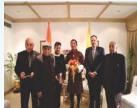
ARSP delegation with P.M. of Bhutan Dr. Lotay Tshering